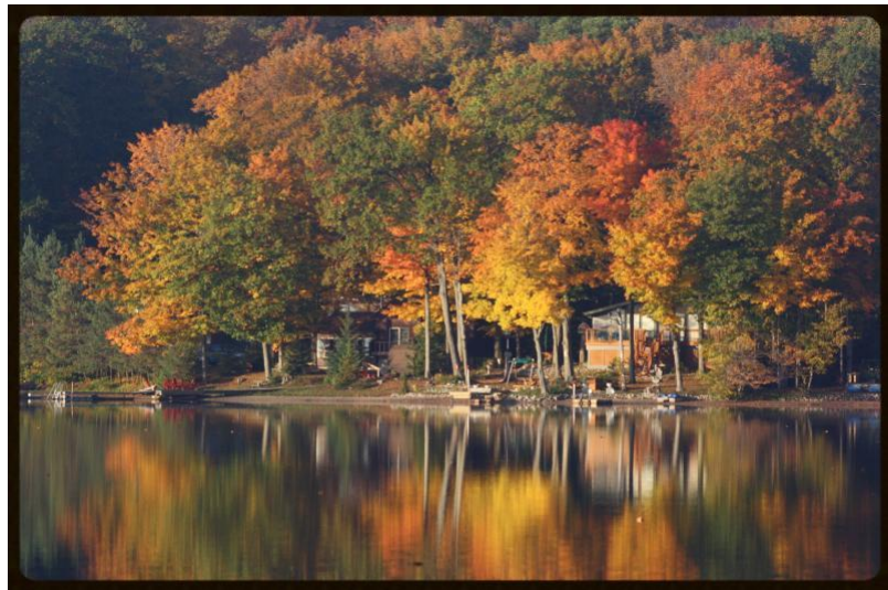
Another season comes to a close!