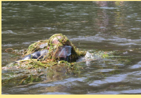
EWM Harvest Gerry Pipe collecting EWM from diver.