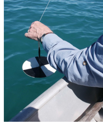
Secchi disk being lowered into water to assess water clarity..

During its sample collection, the FLCA uses a Secchi disk to measure water clarity in the lake for the Lake Partner Program.